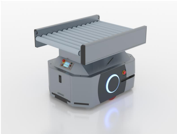
Roller Conveyor LD-250-RC-LW-5

Sturdy and customizable lengthwise roller conveyor for the LD-250 mobile robots. All models have silent and high friction coated rollers as standard, as well as optical sensor at the front of the conveyor to identify the transported products. The height of the conveyor level from the floor can be selected when ordering from 500 mm to 1100 mm. A wide range of accessories available, for example additional sensors, electric stoppers and electric height adjustment.