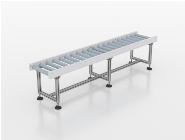
Pick-up and Drop-off Station PDS-1-2-0620-4-0600

Pick-up and Drop-off station matching to our Conveyor Top Modules. Will be built according to your needs. Height, length, width, number of conveyor zones and roller pitch can be selected when ordering. Transported products can also be automatically aligned with the conveyor as an option, which positions and aligns the products against the side guide. A very useful feature for example when the products will be picked up by robot/cobot arm.