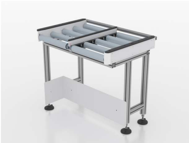
Pick-up and Drop-off station PDS-2-2-0630-1-1-0800 with a CAPS target

Pick-up and Drop-off station matching to our Conveyor Top Modules. Will be built according to your needs. Height, length, width, number of conveyor zones and roller pitch can be selected when ordering. Transported products can also be automatically aligned with the conveyor as an option, which positions and aligns the products against the side guide. A very useful feature for example when the products will be picked up by robot/cobot arm.